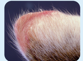
Ear tip of a cat showing cancerous changes – note the reddening of the skin. If your pet is showing signs of skin changes on their nose or ears, please call us.