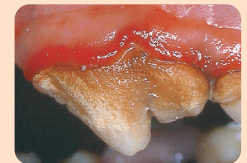
Periodontitis with redness and recession of the gum margin.