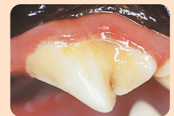
Gingivitis with swollen and inflamed gum margins.

A healthy mouth typically has bright white teeth and pink (or pigmented) gums. However, over time, accumulation of a biofilm of bacterial plaque on the surface of the teeth leads to inflammation of the gums – a condition called gingivitis . At this stage you might notice reddened gums, bad breath and some accumulation of tartar on the tooth surface. Continued tartar build-up will inflame the gums further and also allow bacteria to penetrate below the gum line, progressively destroying the periodontal ligament (the fibrous ligament that anchors the tooth to the bone). This painful condition is called periodontitis , and if left untreated, leads to tooth loosening and eventual tooth loss.