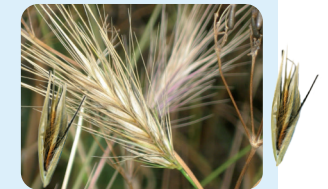
Grass awns of the summer grasses are a perennial hazard