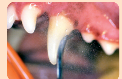
Scale and Polish: Removing the tartar using an ultrasonic scaler, followed by polishing is a very effective form of treatment and should ideally be followed by effective home care.

There is often an area of bright red gingiva overlying the affected area which usually hide a painful cavity in the underlying tooth, although cats will frequently show no obvious outward signs of tooth ache.